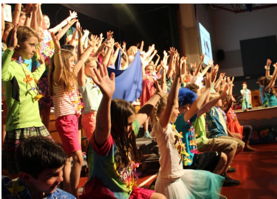
The Middle School Revue (above) at Thursday's School Meeting capped off a busy week on Brookwood's campus that included the Spring Book Fair, parents joining first graders for chess matches and the Grade 8 Mock Trial.